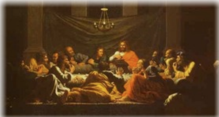
POLJSKA, Nicolas The Eucharist 1847