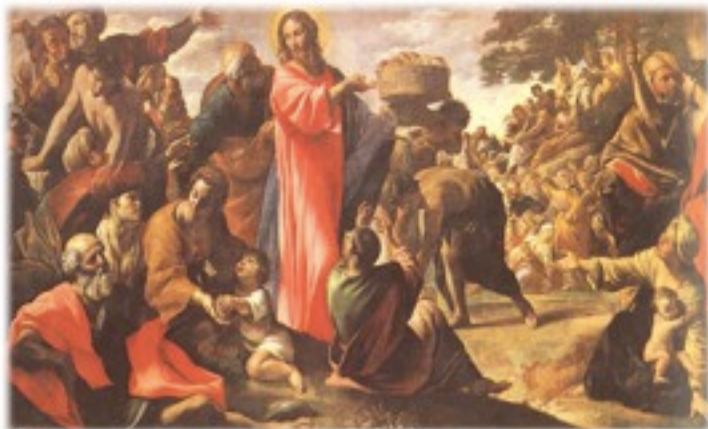
LANFRANCO, Giovanni The Multiplication of the Loaves and the Fishes 1624-1625