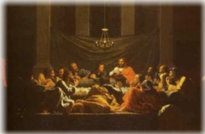
POUSSIN, Nicolas The Eucharist 1647